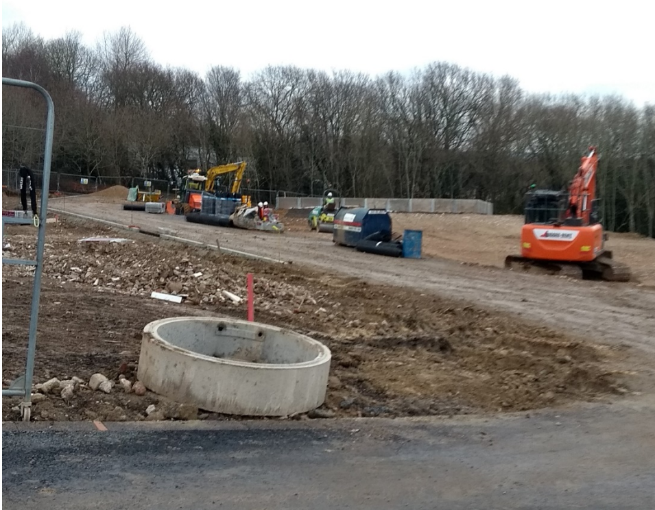
Churchfield construction site, February 2022