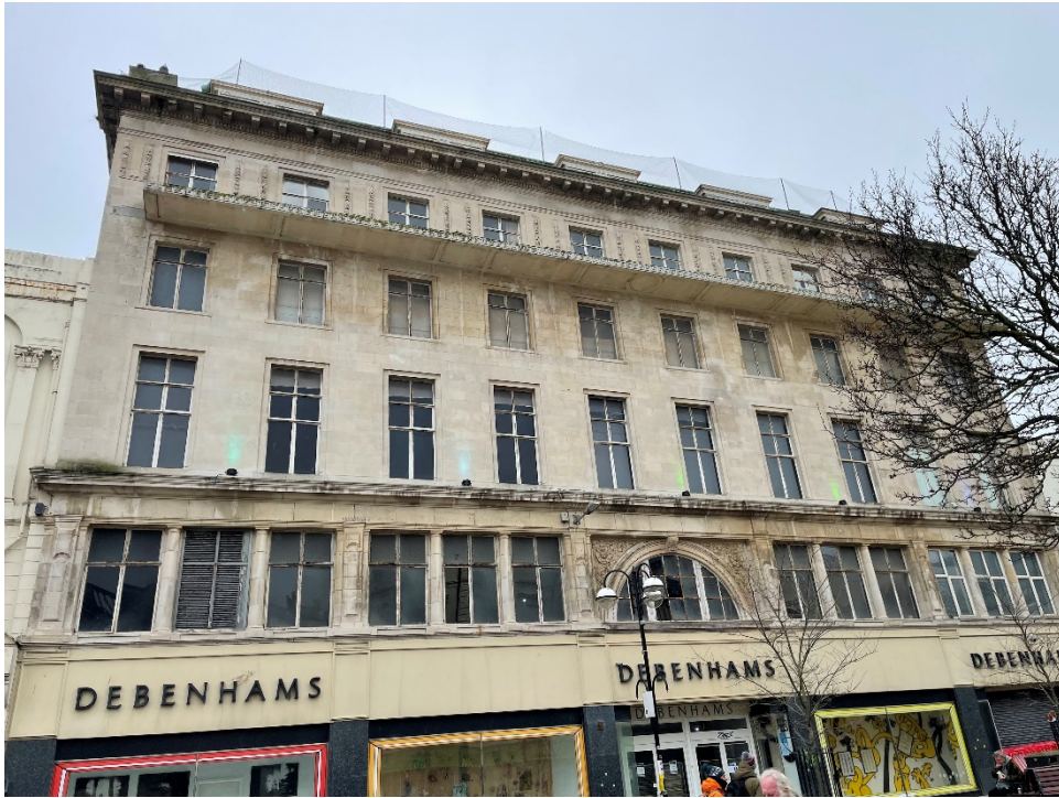
Outside of Debenhams building.