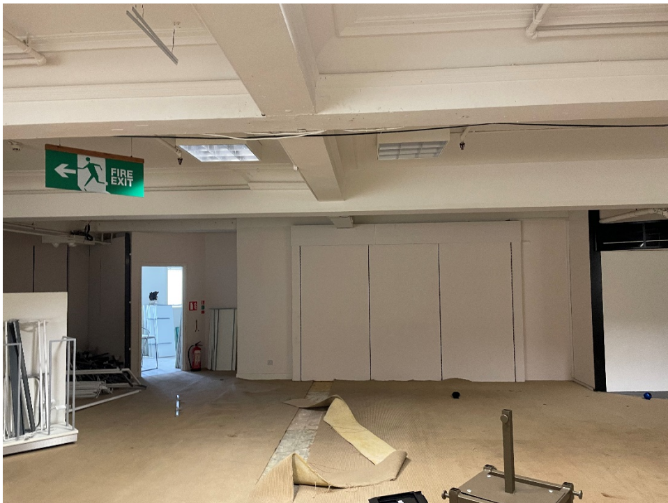
Image of inside the building pre-work being done.